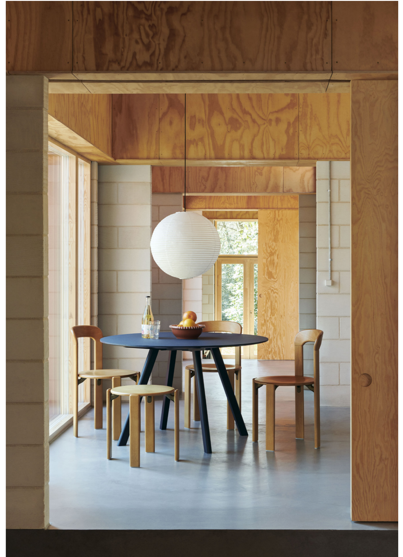
CPH 25 Table Ø120 | Smokey blue linoleum tabletop | Deep blue oak frame

Sharing the same characteristic angled legs as the rest of the Bouroullec brothers' Copenhagen range, the CPH25 table features a round tabletop that softens the engineered expression. The four-legged table frames and tabletops are available in a variety of wood types, materials, and colours, with the possibility to select matching or contrasting combinations. Equally suitable for intimate meetings and larger, café-like environments, this versatile table has an ability to blend into private homes as well as public spaces.