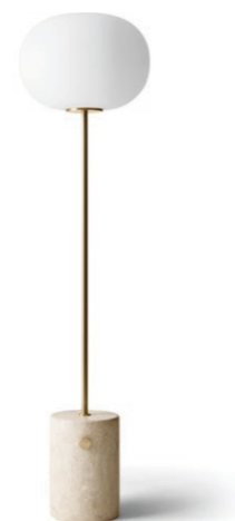
TRAVERTINE / BRUSHED BRASS 1840619

Solid brushed brass or solid bronzed brass stem lamp set on a rounded stone base with elliptical opal glass shade and brass dimmer switch.