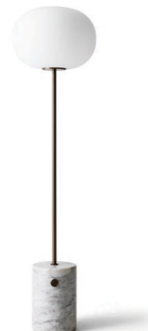
CARRARA MARBLE / BRONZED BRASS 1840639