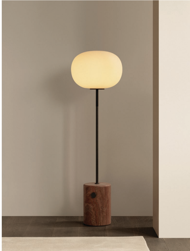
JWDA FLOOR LAMP Designed by Jonas Wagell