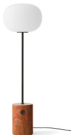
RED TRAVERTINE / BRONZED BRASS 1840329